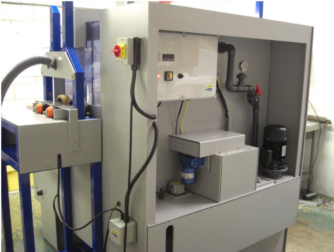
Cylinder drive, idle end